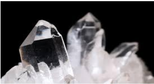
Fig no 2. Piezoelectric Crystals

Piezoelectricity is the electric charge that accumulates in certain solid materials (such as crystals, certain ceramics, and biological matter such as bone, DNA and various proteins) in response to applied mechanical stress. The word piezoelectricity means electricity resulting from pressure. It is derived from the Greek piezo or piezein which means to squeeze or press, and electric or electron which means amber, an ancient source of electric charge. Piezoelectricity was discovered in 1880 by French physicists Jacques and Pierre Curie.