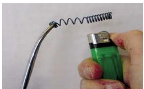
Fig no 1.A Deformed spring regaining shape on application of heat by a lighter

A shape-memory alloy (SMA, smart metal, memory metal, memory alloy, muscle wire, smart alloy) is an alloy that "remembers" its original shape and that when deformed returns to its pre-deformed shape when heated.